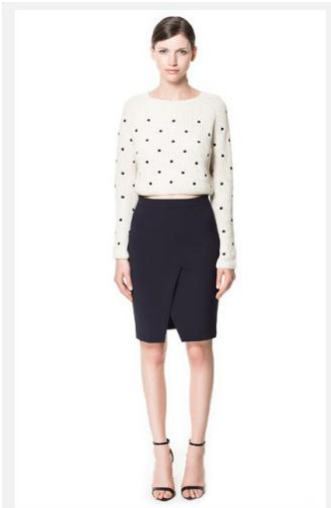
PENCIL SKIRT WITH FRONT SLIT - 59.90 CAD