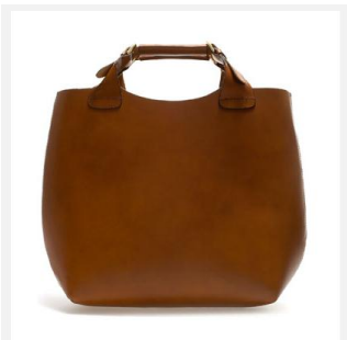
BRAIDED SHOPPER - 159.00 CAD