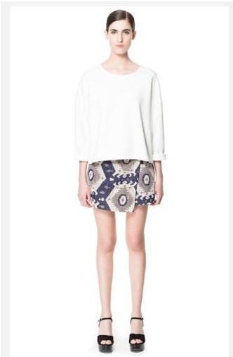
JACQUARD SARONG SKIRT - 49.90 CAD