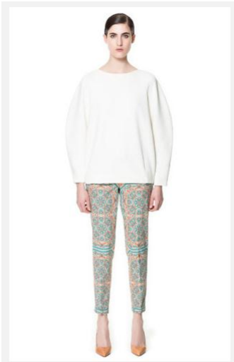
PAISLEY PRINT TROUSERS - 59.90 CAD