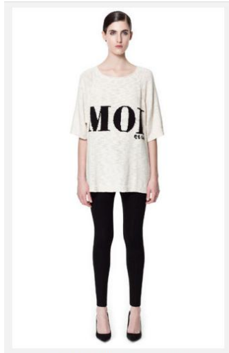
MOI ET TOI SWEATER - 49.90 CAD