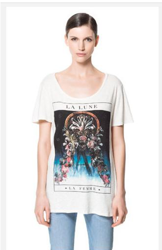
TAROT T-SHIRT - 29.90 CAD