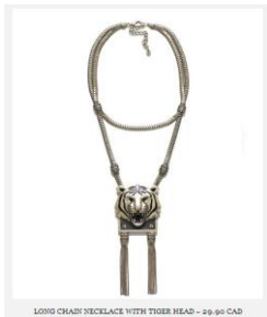
LONG CHAIN NECKLACE WITH TIGER HEAD - 29.90 CAD