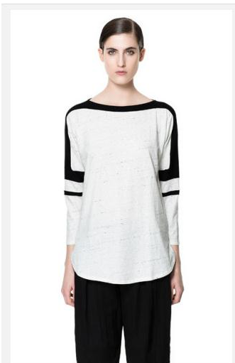
CAPTAIN STYLE T-SHIRT - 35.90 CAD