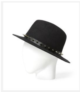
HAT WITH FUR STUPE - 39.90 CAD