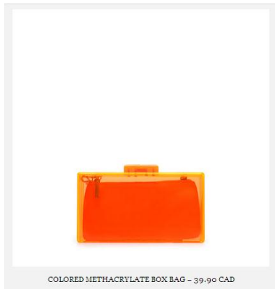
COLORED METHACRYLATE BOX BAG - 39.90 CAD