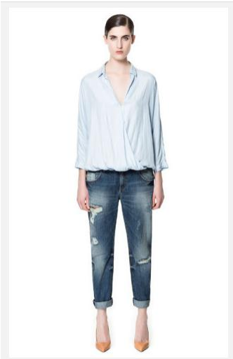
SLIM BOYFRIEND JEANS - 54.90 CAD