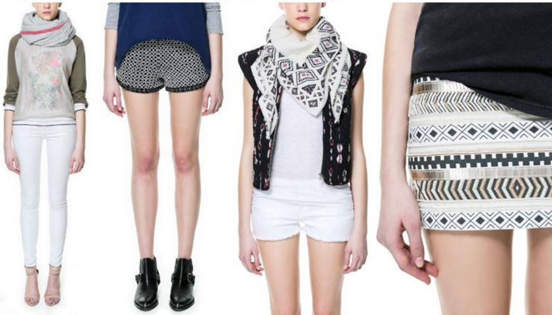
5 Pocket Trousers (White) | Ethnic Pattern Shorts | Rustic Silk Embroidered Ethnic Scarf | Embroidered Skirt

I'm so excited share with you guys that Zara Canada is launching their e-commerce site on March 6th! I've been waiting for this day for a long, long time. Here are some of the looks from their February 2013 lookbook that are "potentials" for me.