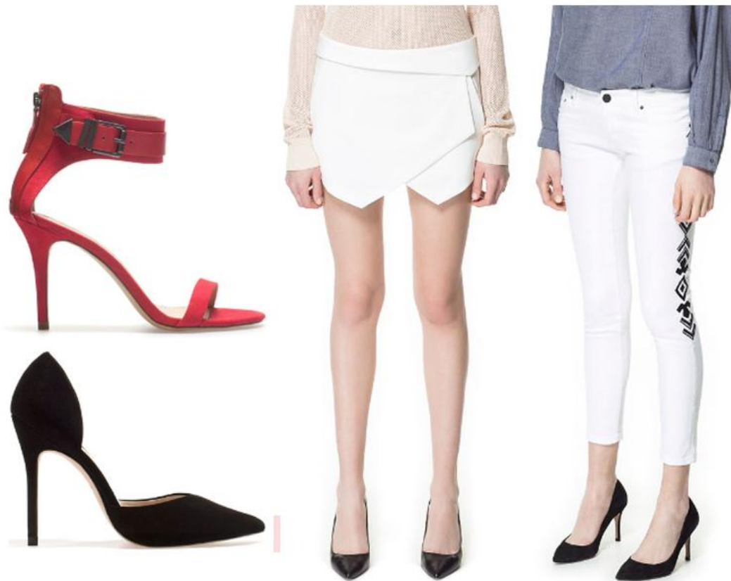
Sandal with Buckle (Strawberry) | High Heel Vamp Shoe | Wrap Mini Skort | Embroidered Denim

White, white, white! I look forward to wearing more stark white pieces this spring/summer. I also want to increase my high heel collection with different colours and unique designs.