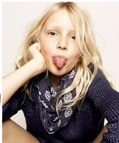
Twill Overshirt with Ethnic Details | Camouflage Print Overshirt | Open Knit Sweater

I frequent the kids department a lot and the two jackets and sweater above are what I'm looking forward to trying out. :) For sizing reference, I'm about a size 12 or L in the Zara Girls department.