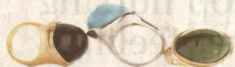
Cabochon rings by Elsa Peretti for Tiffany & Co.