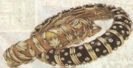
Jean Schlumberger enamel bangles