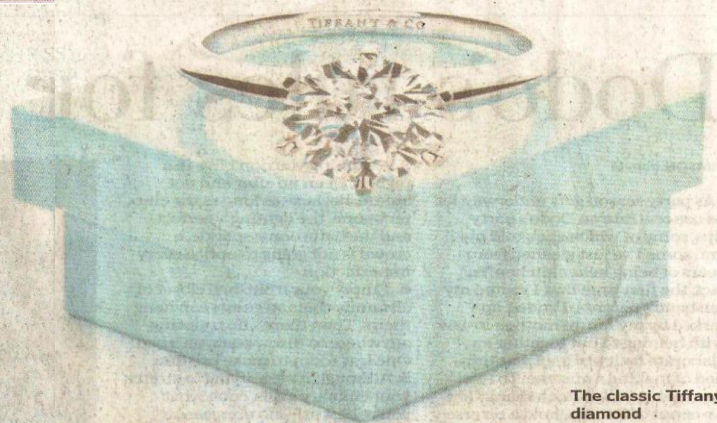
The classic Tiffany diamond engagement ring starts at $1,650 (blue box included).

Topping women's wish lists everywhere — a signature engagement ring from Tiffany & Co., which celebrates its 175th anniversary this year