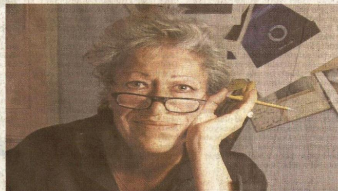
Jewelry designer Elsa Peretti